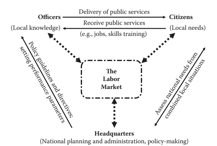
FIGURE 9.1 The agency in relation to its clients and headquarters.

to clients. Figure 9.1 shows the agency in relation to its clients (local citizens), the headquarters, and the labor market.